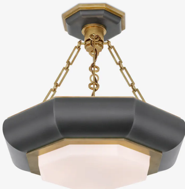
ALBERT GATE HANG