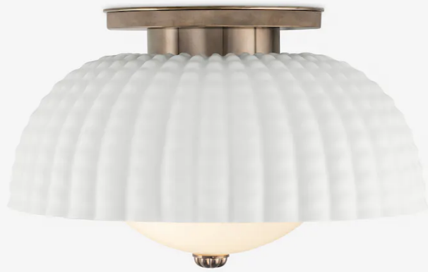
LEASOWE V.2 FLUSH