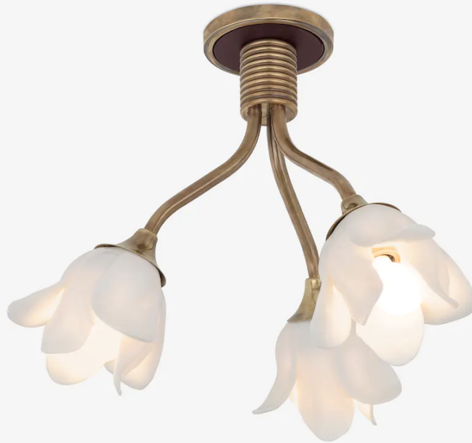
POSY FLUSH TRIPLE