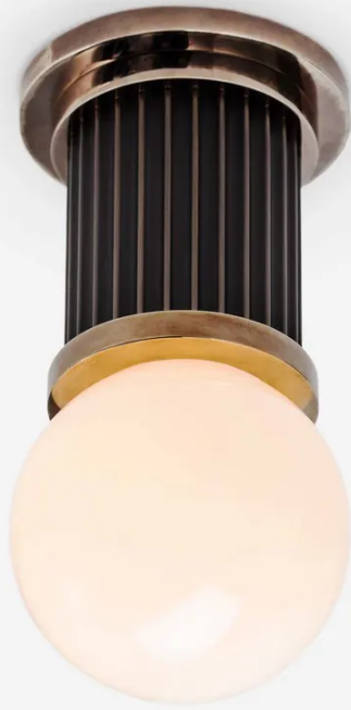
REX V.1 FLUSH