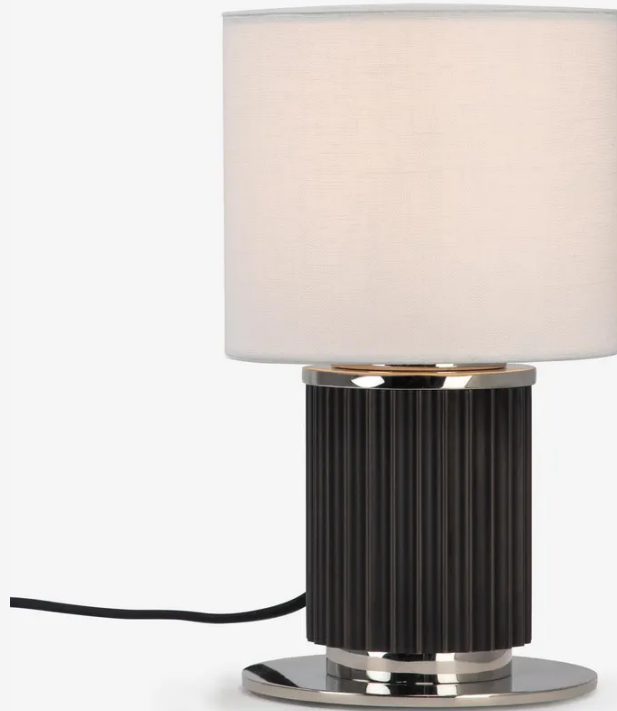
REX TABLE V.2