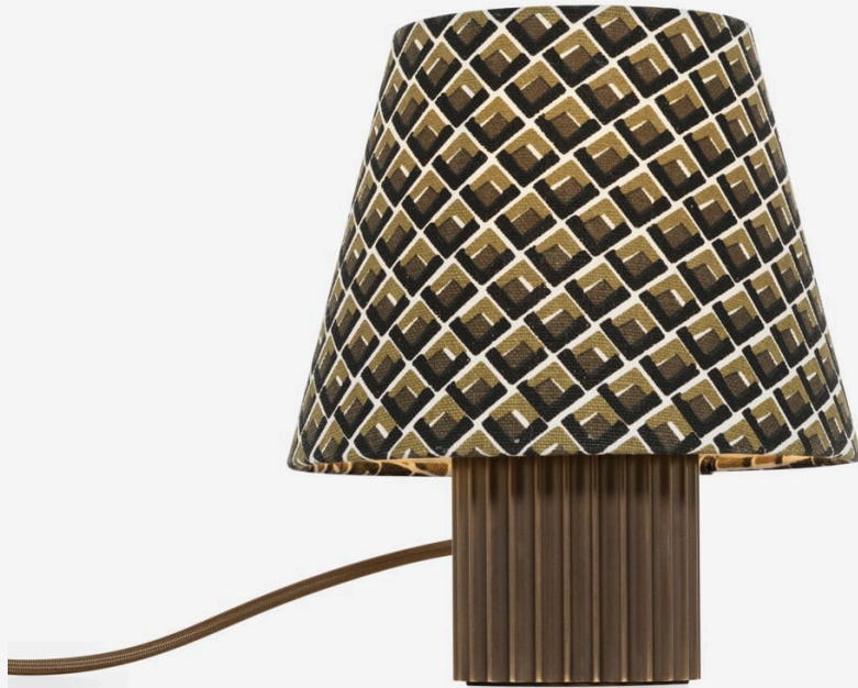
REX TABLE V.3