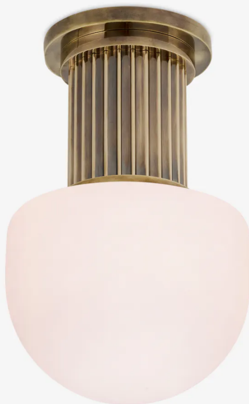
REX V.2 FLUSH