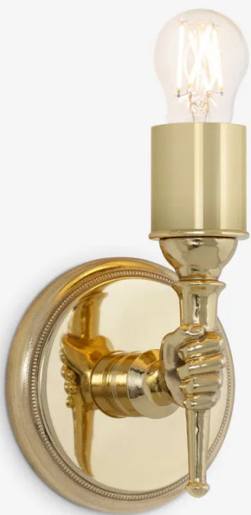
THE HAND SCONCE